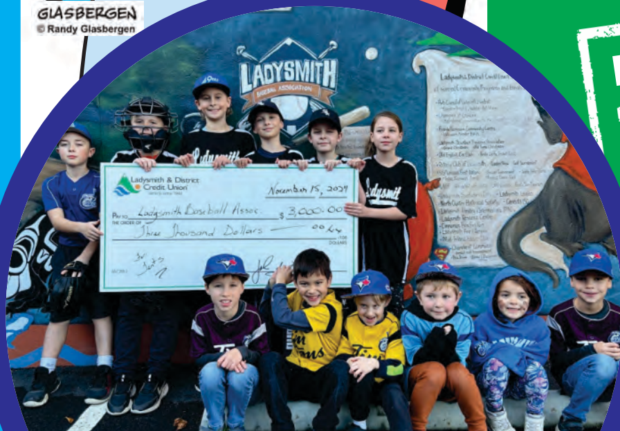
LEFT: LDCU provides financial protection from