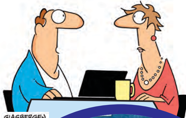
GLASBERGEN © Randy Glasbergen

“When you review your retirement fund, then wet your pants and cry—that’s liquidity.”